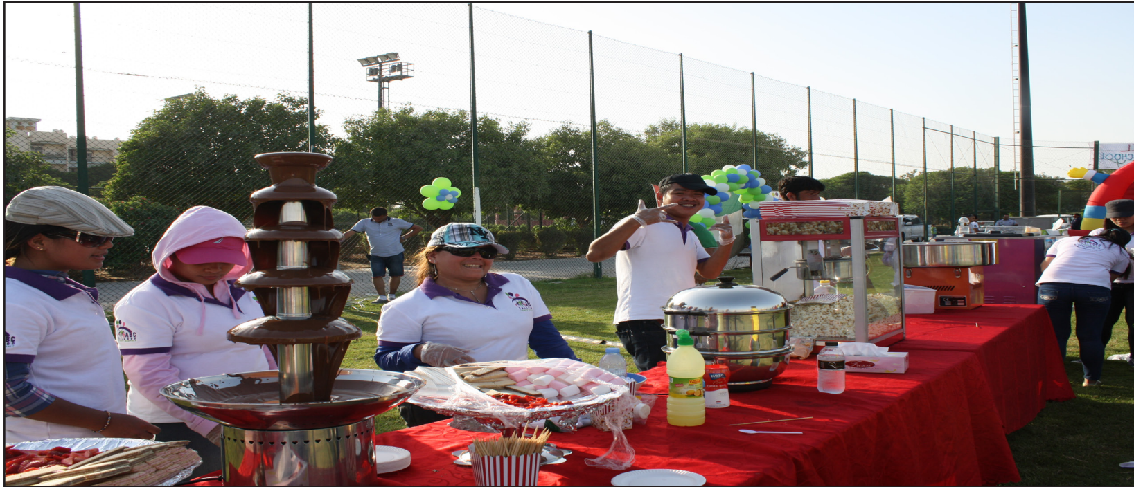
POPCORN, COTTON CANDY & FOUNTAIN CHOCOLATE